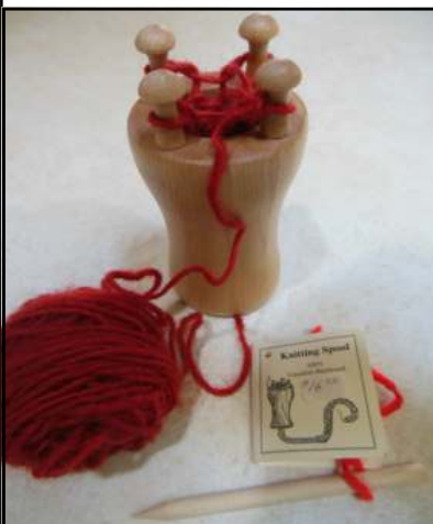
4-peg Knitting Spool

This little knitting spool has many useful applications. I’ve used it to make handles for purses, or ties and decorative effects on garments. Make attractive hair ties. Stitch the resulting I-cord knit tube into a spiral for mats, twist them into animal toys. You get the idea. They are fun and easy to use — even for children. Remember the little “corkers” made from small thread spools with nails on one end? A yarn is wrapped around the wooden pegs. Then the first row is pulled over the second row of yarn creating a knit stitch. The successive knit tube grows down through the hole in the middle of the spool. Instructions included. We are way overstocked on these. Four and six-peg spools are available.