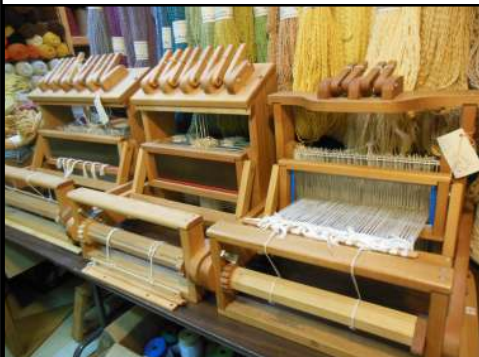
All Three Mountain Looms

Thirty-three years in business! Wow, hard to imagine — one-third of a Century! You can image the amount of Stuff accumulated! So, we’re doing a bit of Spring Cleaning — things overstocked, or not being used, need to move.