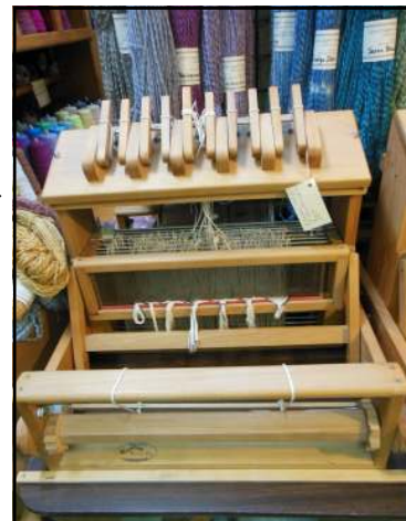
8-shaft, 18-inch Loom

Mountain Looms. Great table top looms, manufacturer no longer in business. We feel these are the best table looms ever made! We have been saving them back to use as great, portable looms for workshops. The beaters have a swinging reed to allow the beater to hit the fell of the cloth at a perpendicular angle for several inches, affording a more evenly placed weft. On their larger, 18-inch 8 shaft loom, they add an extra two levers in the center to which several shafts may be tied. This is particu-